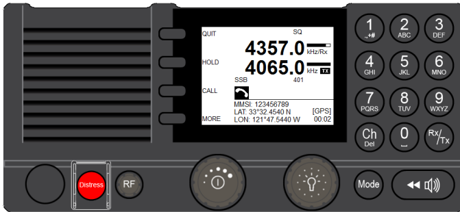
Sailor 6301 MFHF DSC Radio